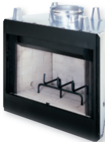
B36 is a full smooth faced model.