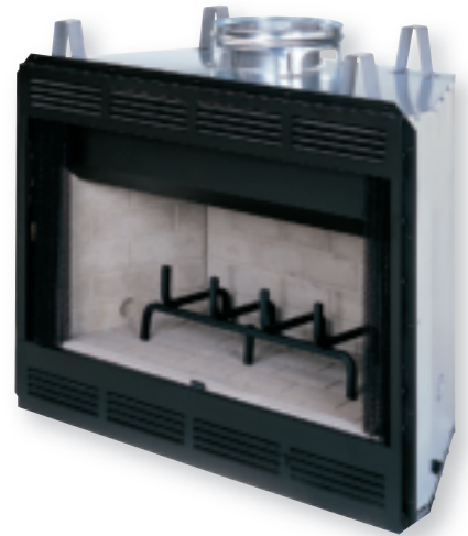
B42L offers louver-faced option for warm air circulation.