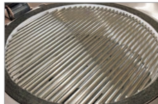
Upper Cooking Grate with Both Sections Inserted