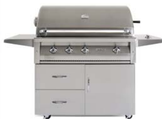
GasJoe Ultra 42"