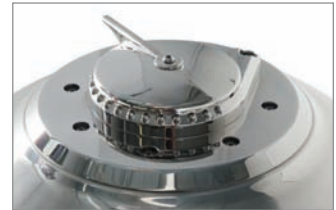
Investment Cast 304 Stainless Steel Top Vent with Mirror Finish