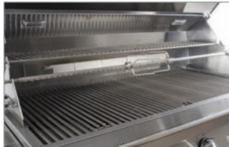
8mm Cooking Grate Rods with Rotisserie and Warming Rack

GasJoe Ultra Specifications | KamadoJoe.com/gasjoe_ultra.html