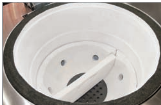
Fire Box Divider for Higher Fuel Efficiency or to Create Separate Cooking Zones