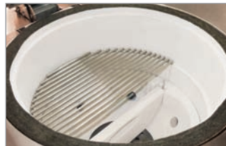
Two-Piece Design 3/8" 304 Stainless Steel Upper and Lower Cooking Grates