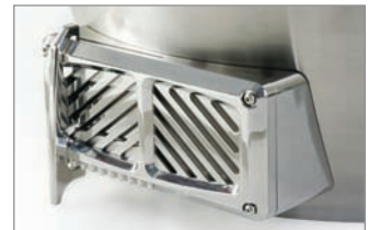
Investment Cast 304 Stainless Steel Draft Door with Mirror Finish