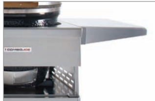
Removable Side Shelves