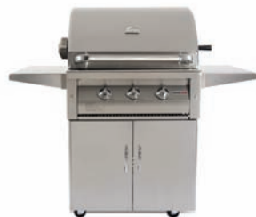
GasJoe Ultra 30"