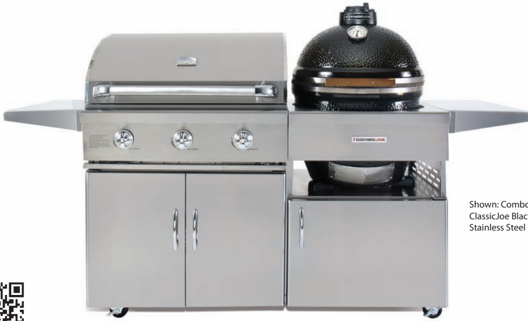
Shown: ComboJoe 32" with ClassicJoe Black Stand Alone with Stainless Steel Bands & Hinge