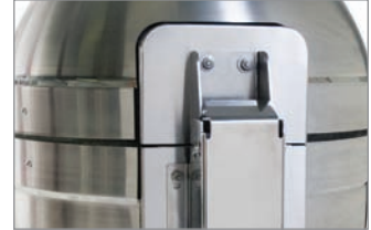
Perfectly Counterbalanced Hinge with Static Positioning as low as 10°

KamadoJoe Specifications | KamadoJoe.com/projoe.html