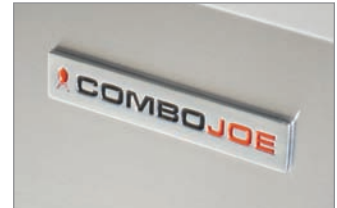
Premium Stainless Steel Finishing