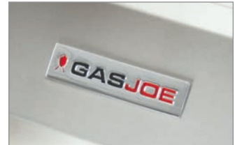
Premium Stainless Steel Finishing