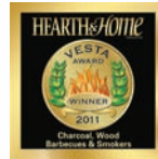
2011 Vesta Award Winner