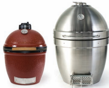
Size Comparison of ClassicJoe and Projoe