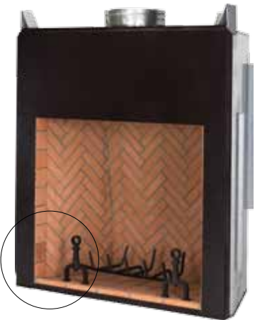
48" WOOD BURNING FIREPLACE