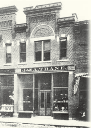
Trane Storefront La Crosse, Wisconsin 1891