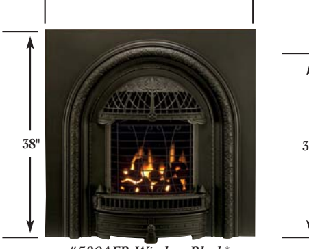
#539AFB Windsor Black* shown with integral closure plate