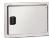
SINGLE ACCESS DOOR MODEL: 12-18-SD CUT-OUT: 12 1/2" x 18 1/2"