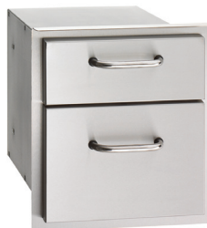
DOUBLE DRAWER MODEL: 16-15-DSSD CUT-OUT: 15 3/4" x 14 1/2" x 20 1/2"