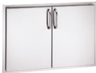
DOUBLE ACCESS DOORS MODEL: 20-30-SSD CUT-OUT: 21" x 30"