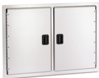
DOUBLE ACCESS DOOR MODEL: 20-30-SD CUT-OUT: 20 1/2" x 30"