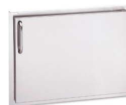
SINGLE ACCESS DOOR* MODEL: 17-24-SSDR OR DL CUT-OUT: 18" x 24 1/2"