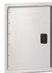
SINGLE ACCESS DOOR MODEL: 18-12-SD CUT-OUT: 18 1/2" x 12 1/2"