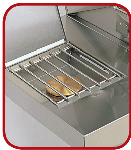
FLUSH MOUNTED SIDE BURNER