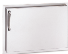
SINGLE ACCESS DOOR* MODEL: 14-20-SSDR OR DL CUT-OUT: 15" x 20 1/2"