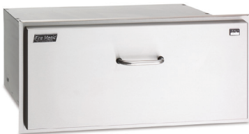
MASONRY DRAWER MODEL: 13-31-SSD CUT-OUT: 13" x 31" x 20 1/2"