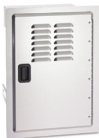
SINGLE ACCESS DOOR (RIGHT OR LEFT) WITH TANK TRAY AND LOUVERS MODEL: 20-14-SDV CUT-OUT: 20 1/2" x 14 1/2" x 20 1/2"