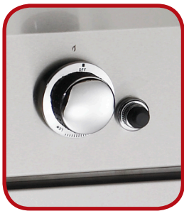
PUSH BUTTON ELECTRONIC IGNITION