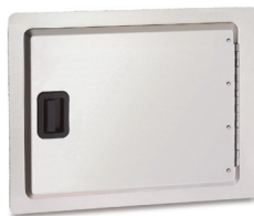
SINGLE ACCESS DOOR MODEL: 17-24-SD CUT-OUT: 17 1/2" x 24 1/2"