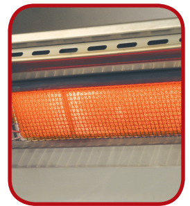
BUILT-IN BACK BURNER