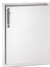
SINGLE ACCESS DOOR* MODEL: 20-14-SSDR OR DL CUT-OUT: 21" x 14 1/2"