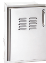
SINGLE ACCESS DOOR WITH TANK TRAY AND LOUVERS* MODEL: 20-14-SSDLV OR DRV CUT-OUT: 21" x 14 1/2" x 20 1/2"