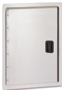
SINGLE ACCESS DOOR MODEL: 24-17-SD CUT-OUT: 24 1/2" x 17 1/2"