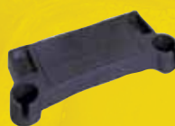
Black Composite Surface Front Shelf