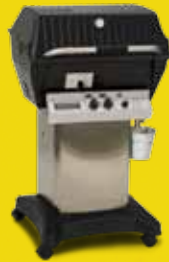
Stainless Steel Cart