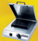
Stainless Steel Side Burner (Stationary)