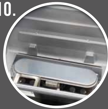
10. STAINLESS STEEL OVAL BURNER