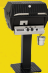
Painted Steel Patio Post with Cast Iron Base