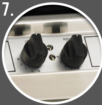
7. DUAL BURNER CONTROLS