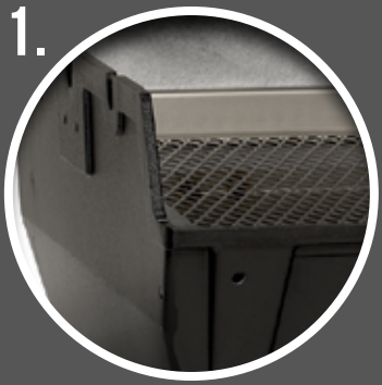
1. THICK CAST ALUMINUM HEAD