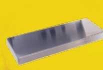
Stainless Steel Front Shelf