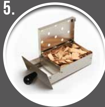
5. FRONT-LOAD SMOKING CHIP DRAWER