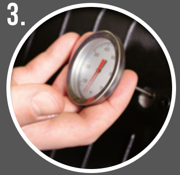
3. PRECISION PROBE HEAT INDICATOR