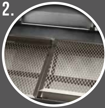
2. TWO-PIECE STAINLESS STEEL DIAMOND PATTERN GRIDS (2-LEVEL)