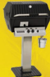
Stainless Steel Patio Post with Cast Iron Base