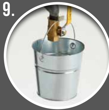
9. COLLECTION BUCKET