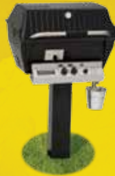
Painted Steel In-ground Post