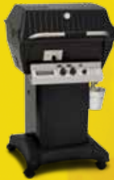
Black Painted Steel Cart