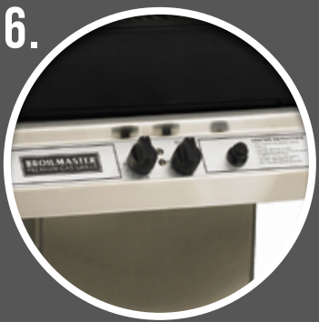
6. STAINLESS STEEL CONTROL PANEL