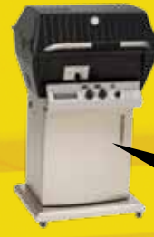
Stainless Steel Storage Cart