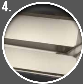
4. STAINLESS STEEL DRIP PAN