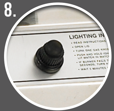
8. ELECTRONIC IGNITION