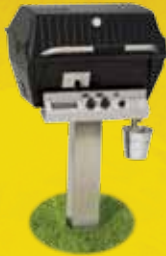
Stainless Steel In-ground Post