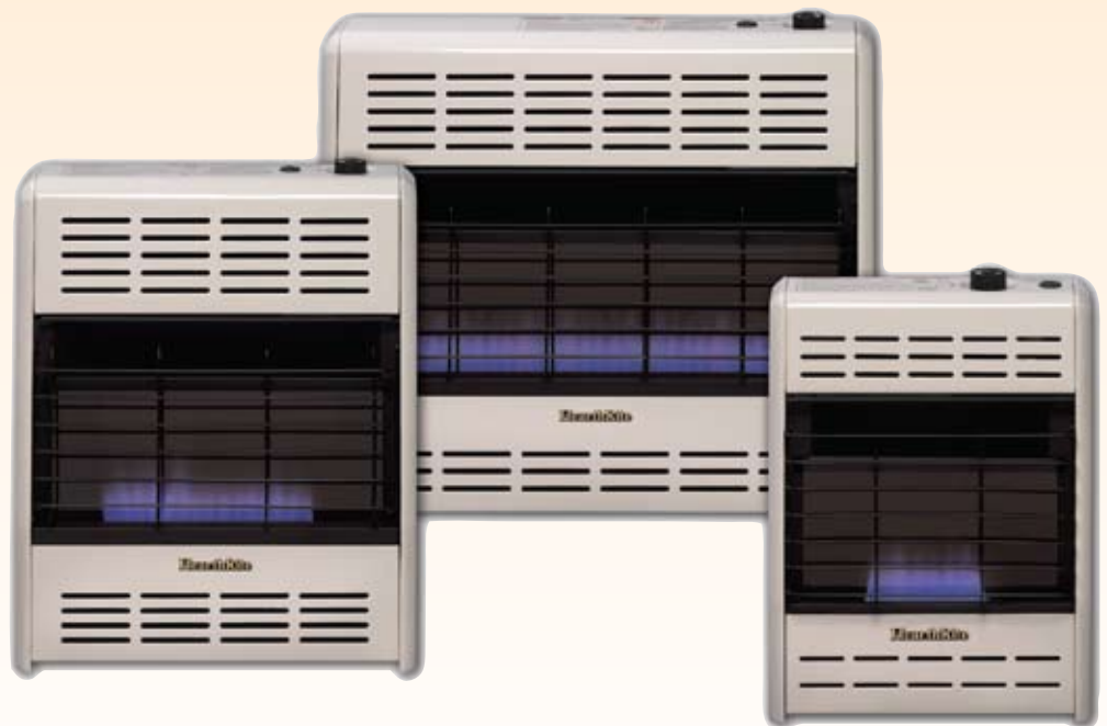
Blue Flame Vent-Free Gas Heater