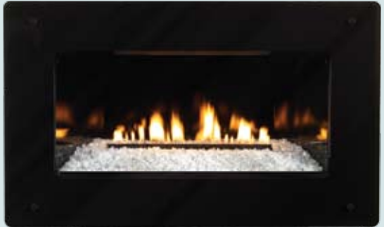
28,000 Btu Loft Series Fireplace with Decorative Glass Front and Clear Frost Glass

Enhance the heat distribution of your Loft Fireplace with the optional blower. The quiet air circulation system features variable speed control and automatic operation.