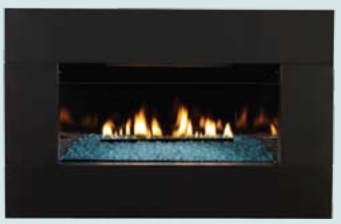
20,000 Btu Loft Series Fireplace with Decorative Metal & Glass Frame and Blue Clear Glass