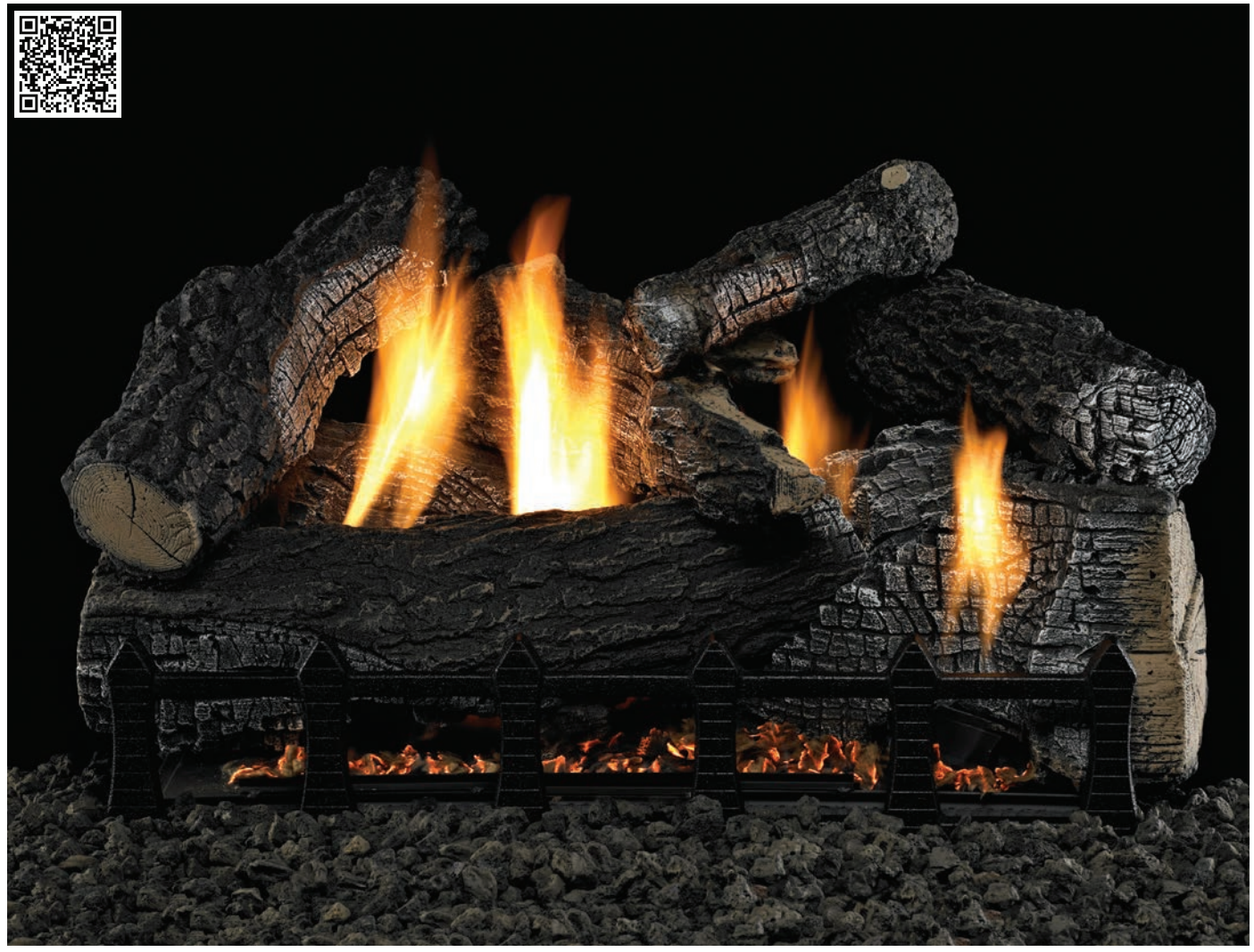
Refractory Super Wildwood Log Set (LX-24WRS) on Harmony Burner (VFNI-24) with Decorative Cast Grate (DCG-24-BL)