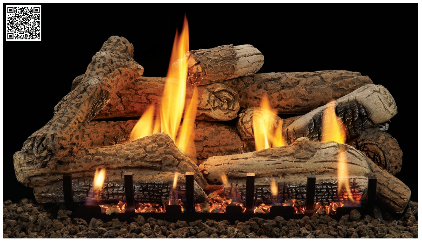
Ceramic Fiber Morgan Creek Log Set (LS-24MC) with Slope Glaze Burner System (VFSR-24)