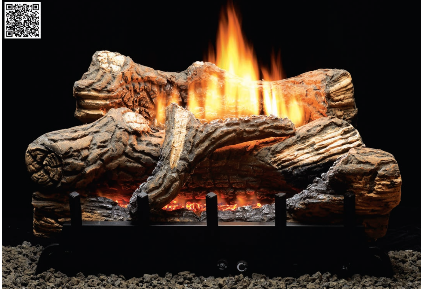
Ceramic Fiber Flint Hill Log Set and Burner Combination (VFDR-24)

This competitively priced log/burner is ideal for existing fireplaces and fireboxes, and for new construction.