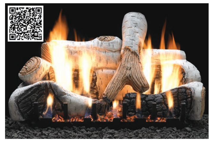
Ceramic Fiber Birch Log Set (LS-24B2) with Slope Glaze Burner System (VFSR-24)