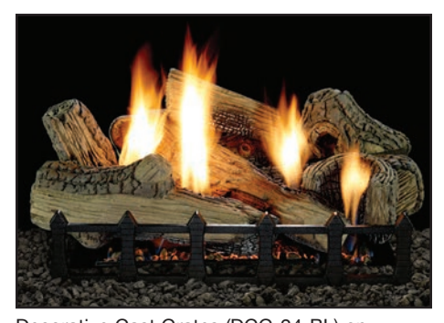
Decorative Cast Grates (DCG-24-BL) on 24-Inch Canyon Log Set (LS-24RS) on Vent Free Harmony Burner.