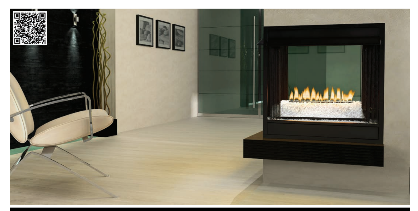
Loft Series Multi-sided burner (VFRU-24) with Clear Frost Decorative Glass (DG-30-CLF). Shown in a Vent-Free peninsula firebox with Flush Louvers.