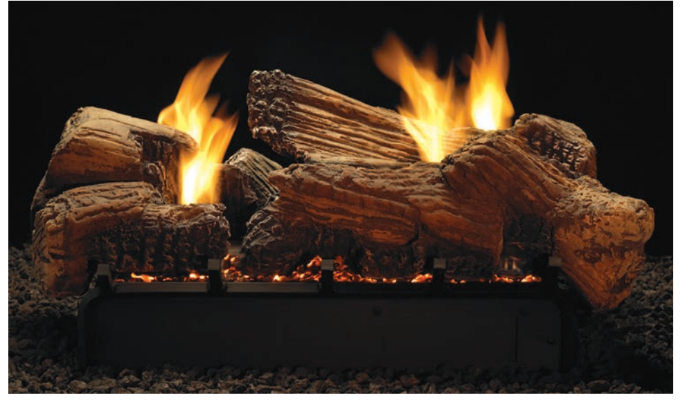
The Stone River Ceramic Fiber Log Set provides a different look from every angle. The Slope Glaze Vista Burner neatly conceals its controls behind a sliding panel.