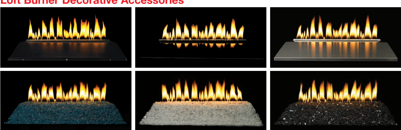
Top Row left to right: No Decorative Options, Polished Black Decorative Top, Brushed Stainless Steel Decorative Top. Bottom Row left to right: Blue Clear Decorative Glass, Clear Frost Decorative Glass, Polished Black Decorative Glass