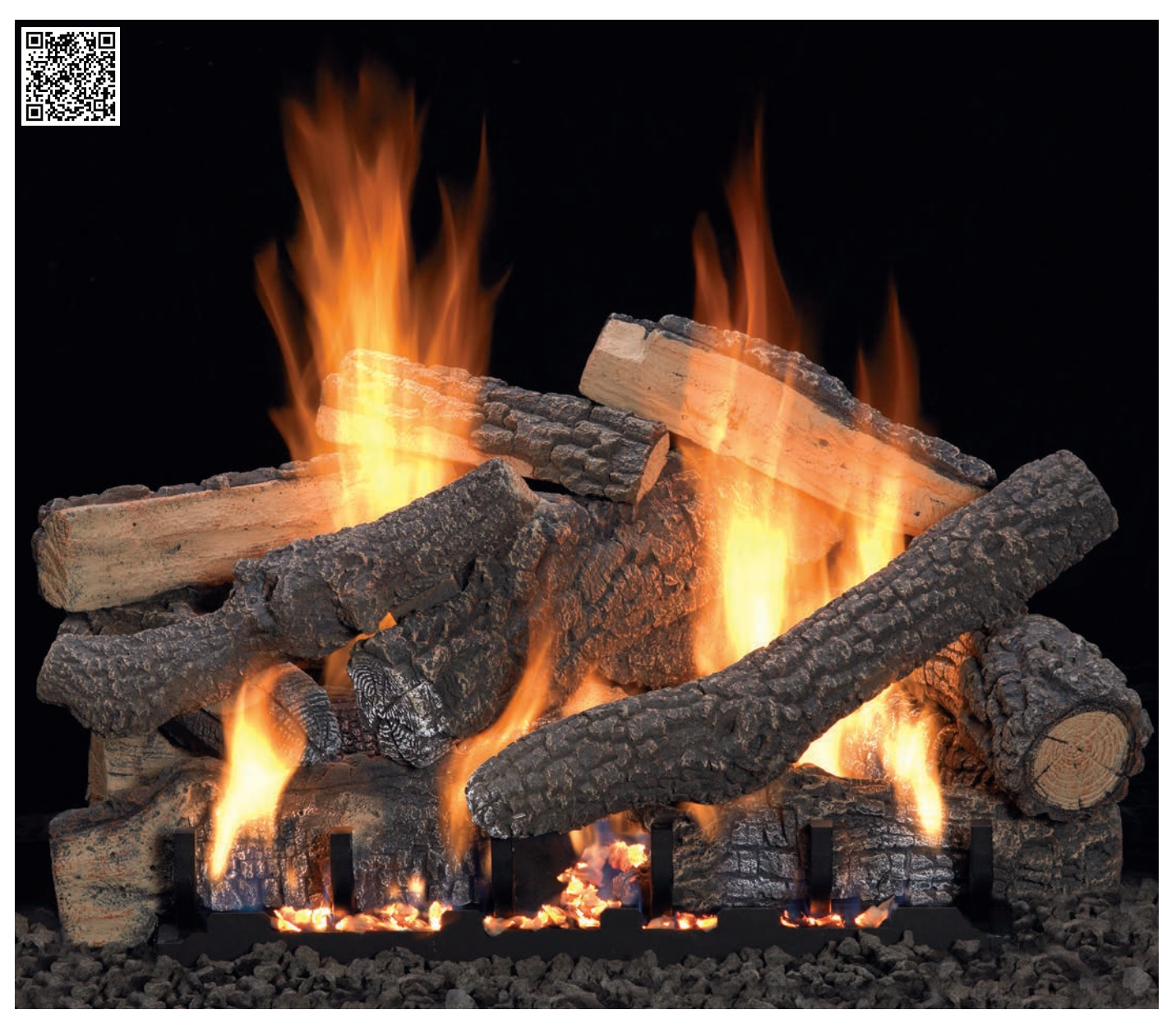
Refractory Ponderosa Log Set (LS-24P) with Vented Slope Glaze Burner System (VSR-24) rated at 75,000 Btu

Our Vented Burners, available in the Slope Glaze Series only, are rated at up to 75,000 Btu to create taller flames. Vented log sets are rated as decorative systems (not for use as heaters), and must be installed in a vented fireplace with the damper open and may not operate on a thermostat. Vented Slope Glaze burners are available in 18, 24, and 30 inches in Millivolt and manual models. The Millivolt Vented Burners may be operated with an on/off remote control or wall switch.