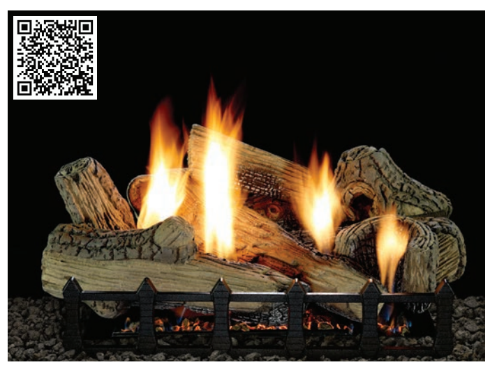
Ceramic Fiber Canyon Log Set (LX-24CF) on Harmony Burner (VFNI-24) with Decorative Cast Grate (DCG-24-BL)