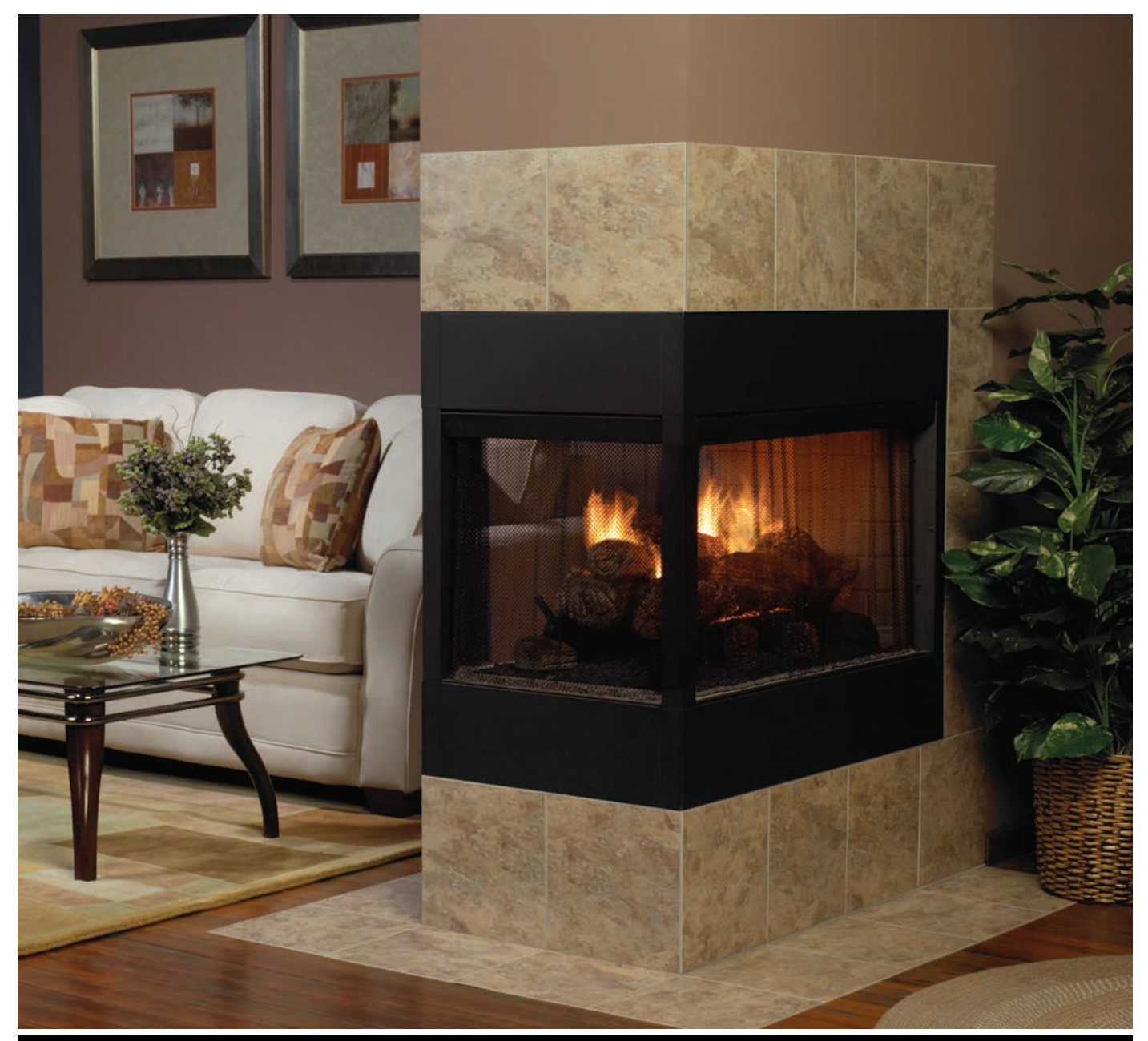
White Mountain Hearth Stone River Log Set (LSU-24SF) on a Vent-Free Slope Glaze Vista Burner. Shown in a peninsula firebox with custom tile surround. The optional Large Log Embers Kit (EK-2) and Platinum Glowing Embers (PE20) add that extra spark of realism.