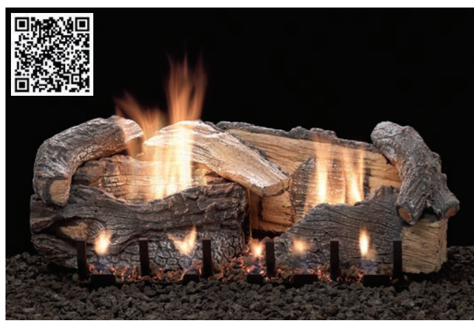
Refractory Aged Oak Log Set (LS-24RAO) with Slope Glaze Burner System (VFSR-24)