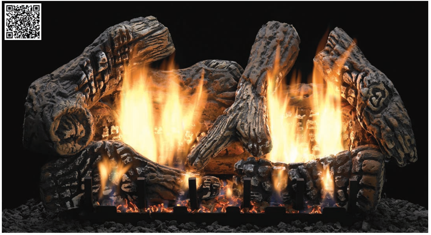
Ceramic Fiber Super Charred Oak Log Set (LS-24C2S Shown) with Slope Glaze Burner System (VFSR-24)

Our new Intermittent Pilot systems – available in Slope Glaze and Harmony burners – eliminate the standing pilot for even greater fuel savings. IP systems include a thermostat remote control and must be installed in Vent-Free applications only. Even our manually controlled log sets offer three heat levels, to keep the cold winds at bay without overheating the room.