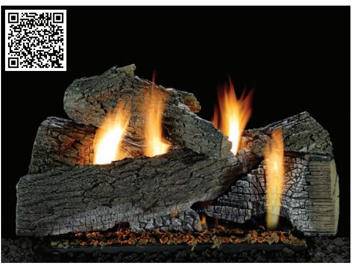
Refractory Wildwood Log Set (LX-24WR) on Harmony Burner with Expanded Ember Bed (VFXI-24)