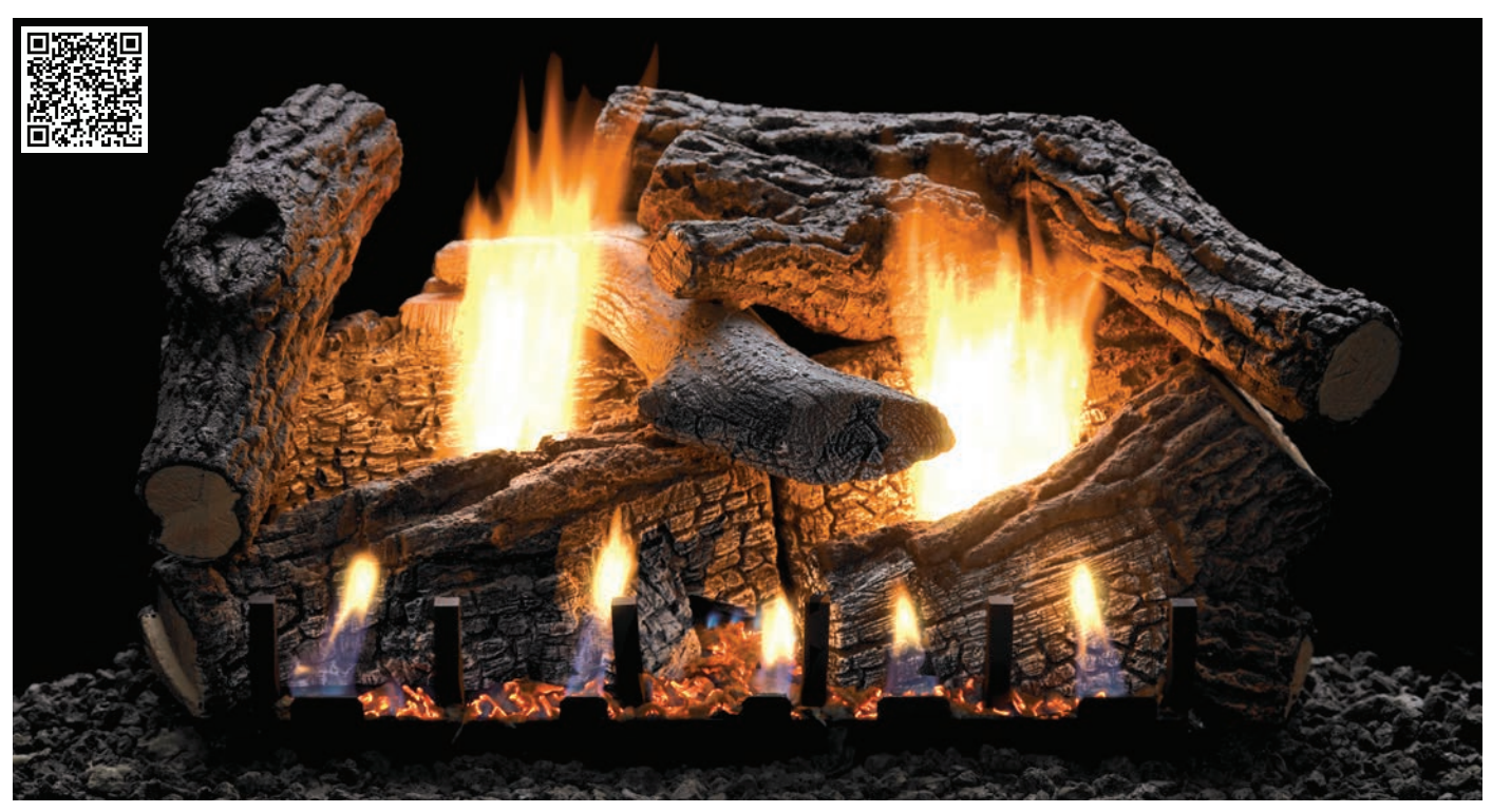
Refractory Super Sassafras Log Set (LS-24RSS) with Slope Glaze Burner System (VFSR-24)