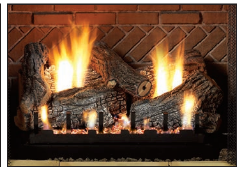
24-Inch Sassafras Log Set (LS-24RS) on Vent Free Slope Glaze Burner with LR-24 Log Riser in Vent Free Select Firebox.