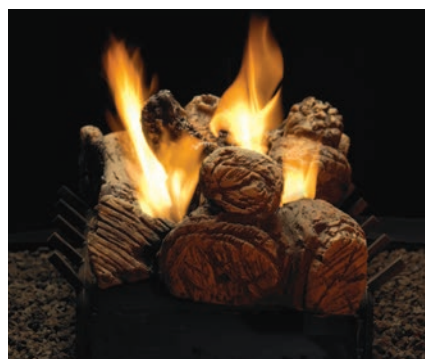
Opposite Side View (above) and End View (below)