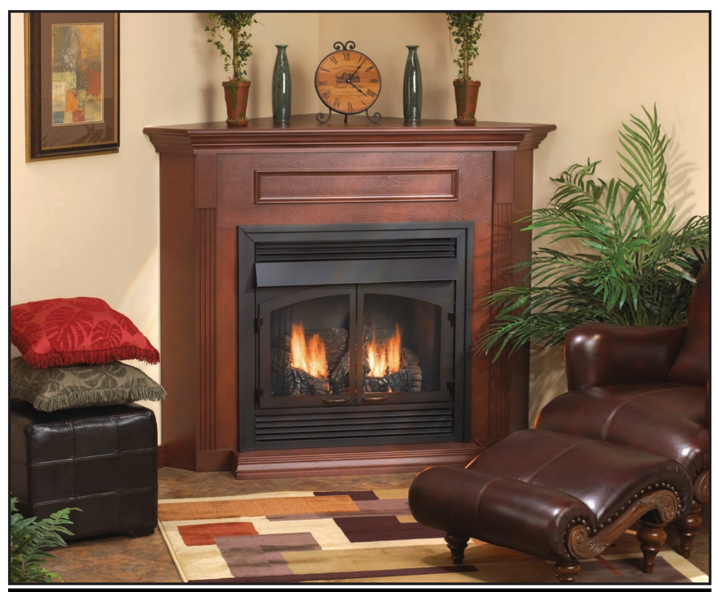
White Mountain Hearth Charred Oak Log Set (LS-24C2) on a Vent-Free Slope Glaze Burner with variable remote control system (VFSV-24). Shown with a 36-inch Breckenridge Deluxe Vent-Free Firebox (VFD36FB0F) trimmed in black louvers, black hood, and shown with optional Brick Liner, black frame, black door frame and black arch doors (DVF-36BL, VFY-36-SBL, and VFR-36-SCBL). The Cherry Finish on the Standard 36-inch Corner Cabinet Mantel (EMC-36-C) adds drama and warmth to any setting.

Empire manufactures log sets and burners to suit any application in sizes ranging from 16 inches to 30 inches, in Natural Gas and LP.