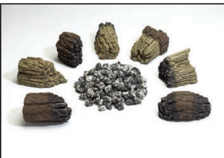
EK-2 Large Ember Kit available for Multi-sided log sets or large fireplaces.