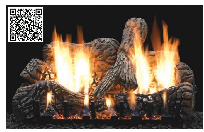
Ceramic Fiber Charred Oak Log Set (LS-24C2) with Slope Glaze Burner System (VFSR-24)

Your White Mountain Hearth Vent-Free logs create a consistent, controlled heat – without dangerous flare-ups or chilling die-downs. These gas logs warm your room quickly and efficiently, while using about half the energy of a vented gas log.