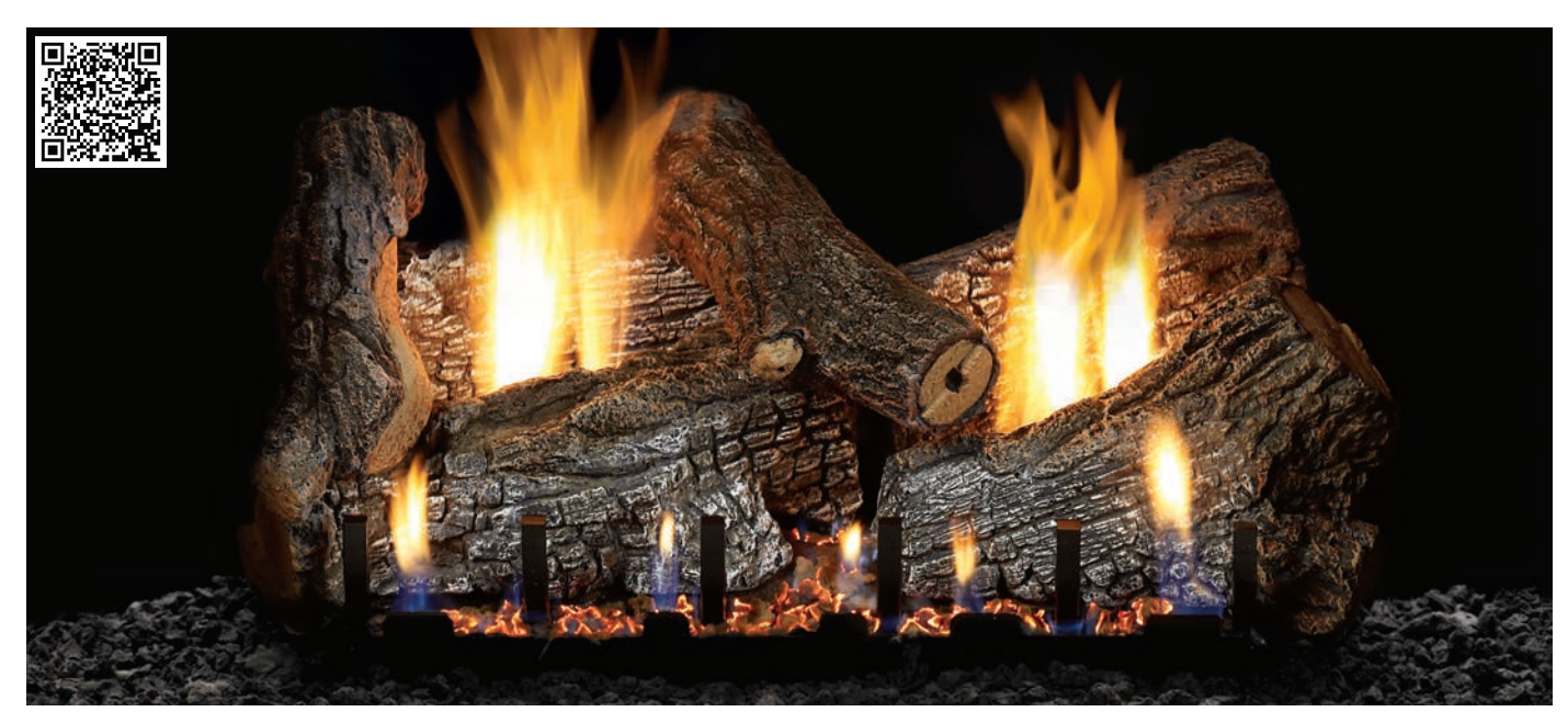
Refractory Sassafras Log Set (LS-24RS) with Slope Glaze Burner System (VFSR-24)