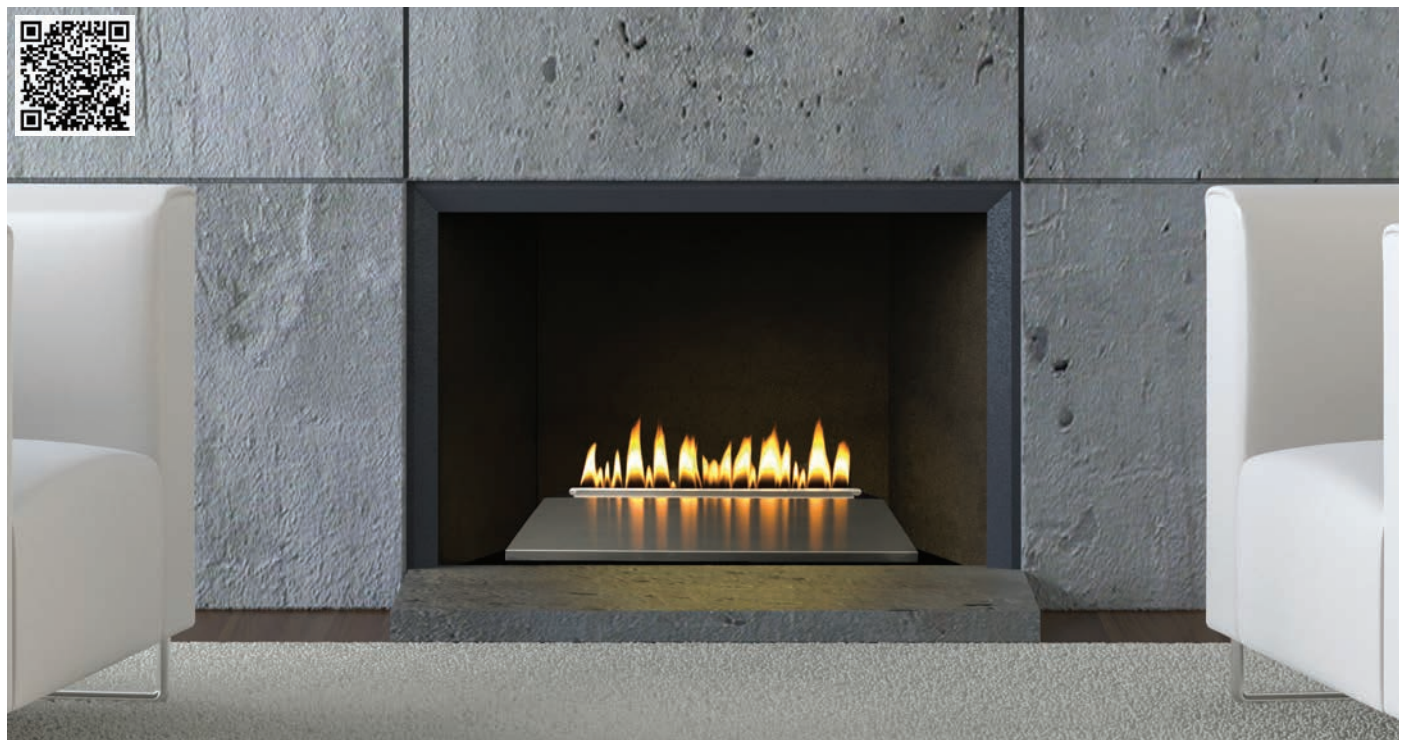
Loft Series Burner (VFRL-24) with Stainless Steel Decorative Top (DT-24-SS). Shown in existing masonry firebox.