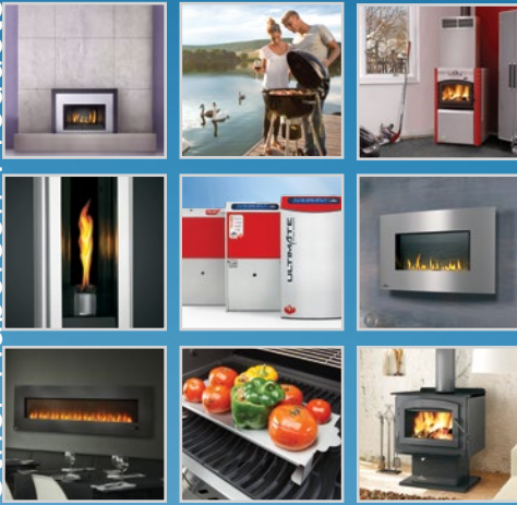
Fireplace Inserts • Charcoal Grills • Hybrid Furnaces • Outdoor Fireplaces Gas Furnaces • Gas Fireplaces • Electric Fireplaces • Accessories • Wood Stoves