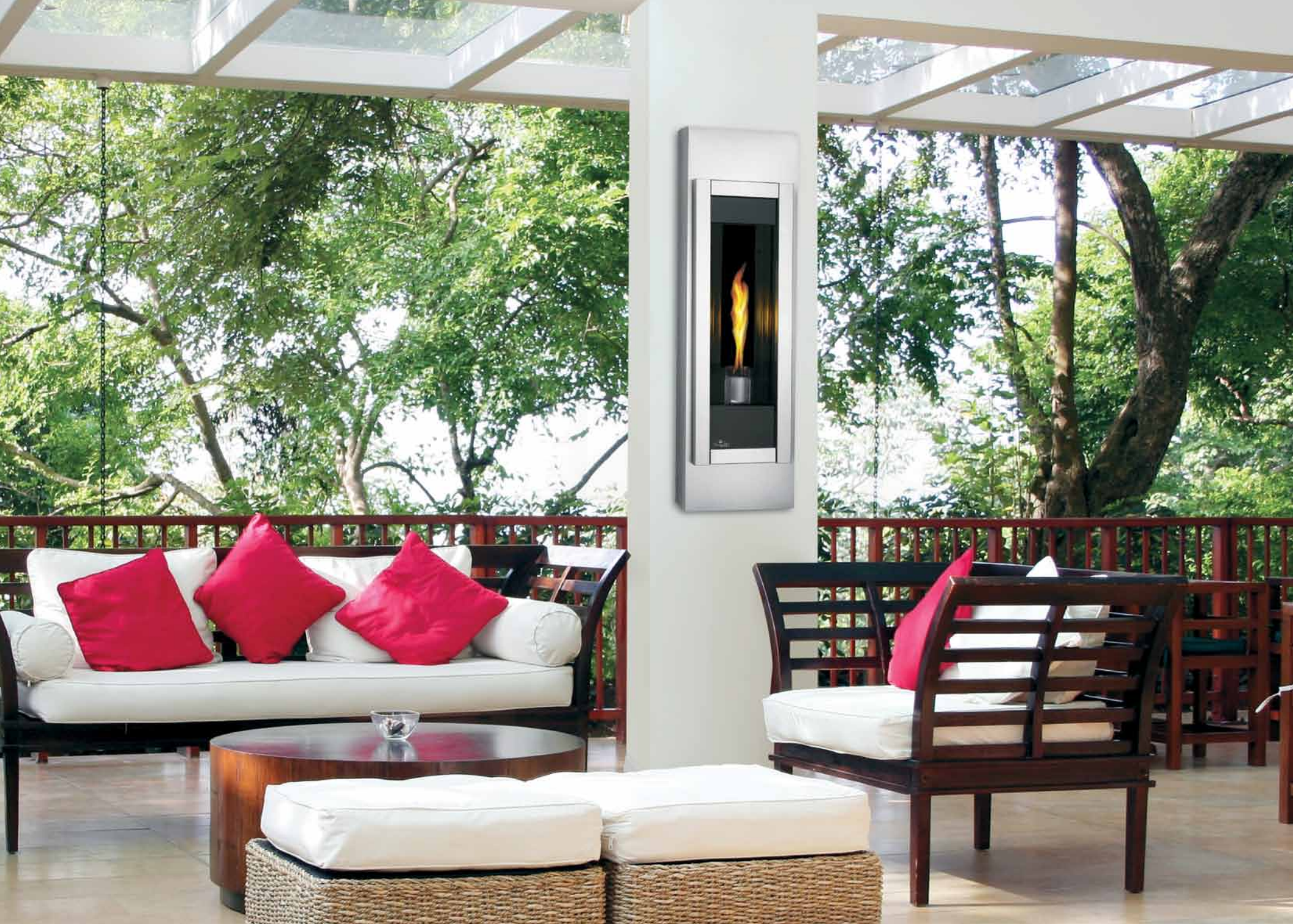
GSST8 shown with standard brushed stainless steel cabinet and frame/front