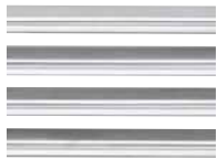
Louvers Brushed stainless steel upper and lower louvers Standard with unit