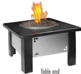
Table and Black Granite Top