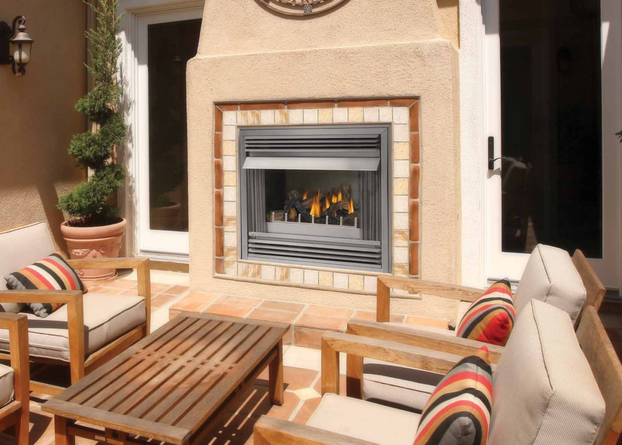
GSS36 shown with brushed stainless steel upper & lower louvers and stainless steel mesh safety screen