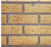
Decorative Panels Decorative Sandstone Brick