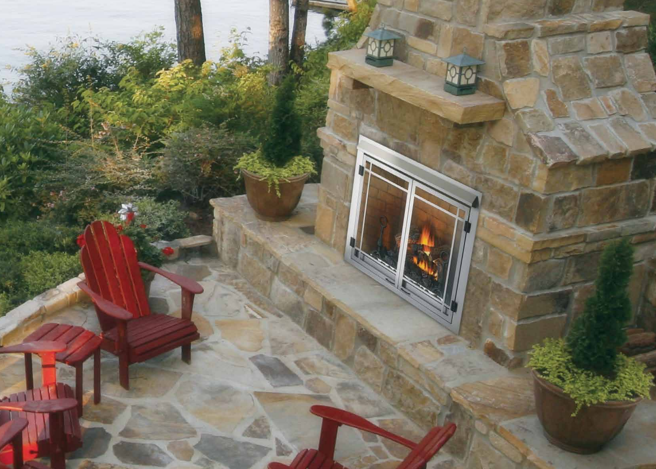
GSS42 shown with standard brushed stainless steel double doors and optional decorative sandstone brick panels