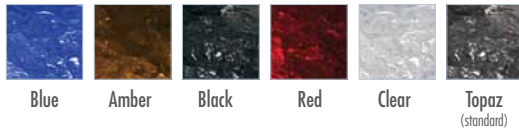
Blue Amber Black Red Clear Topaz (standard)