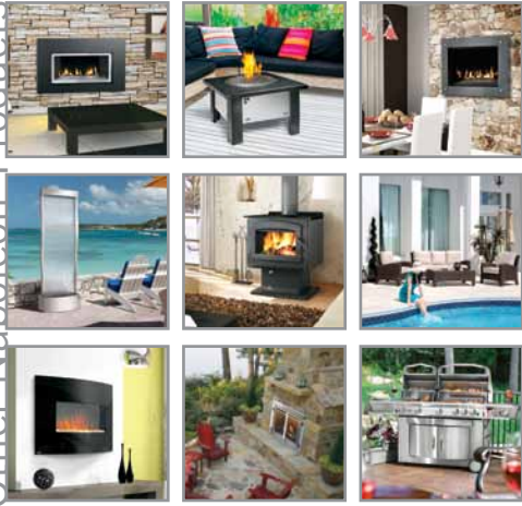
Fireplace Inserts • Patioflame® • Gas Fireplaces • Waterfalls • Wood Stoves Casual Furniture • Electric Fireplaces • Outdoor Fireplaces • Gourmet Gas Grills