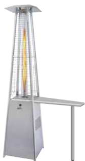
Side Shelf and Bar Table